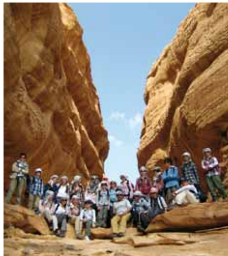
The team from Marlborough College in the sandstone desert, where they were guided by long-standing friends of Wind Sand & Stars from the Muzeina tribe. It has been a particularly tough year for the more remote communities.